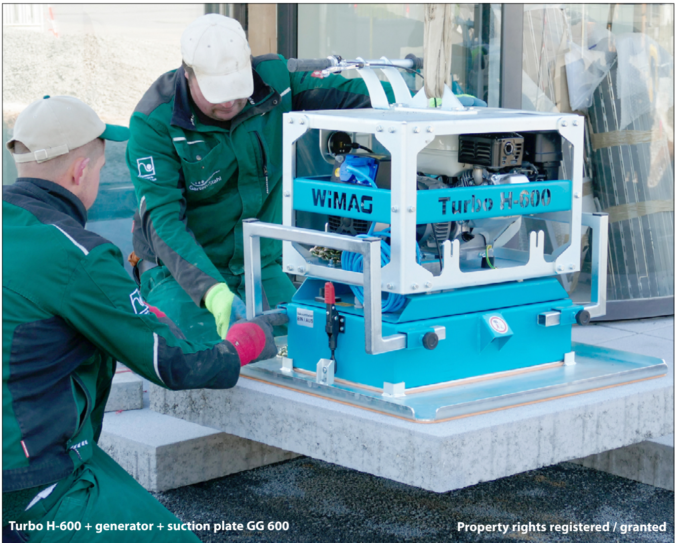
Turbo H-600 + generator + suction plate GG 600