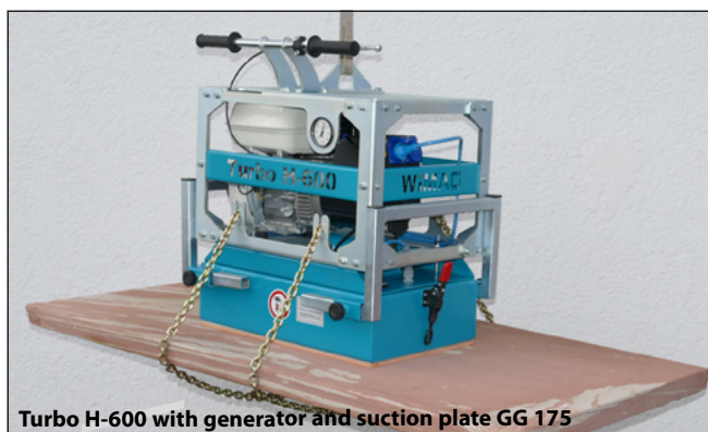
Turbo H-600 with generator and suction plate GG 175