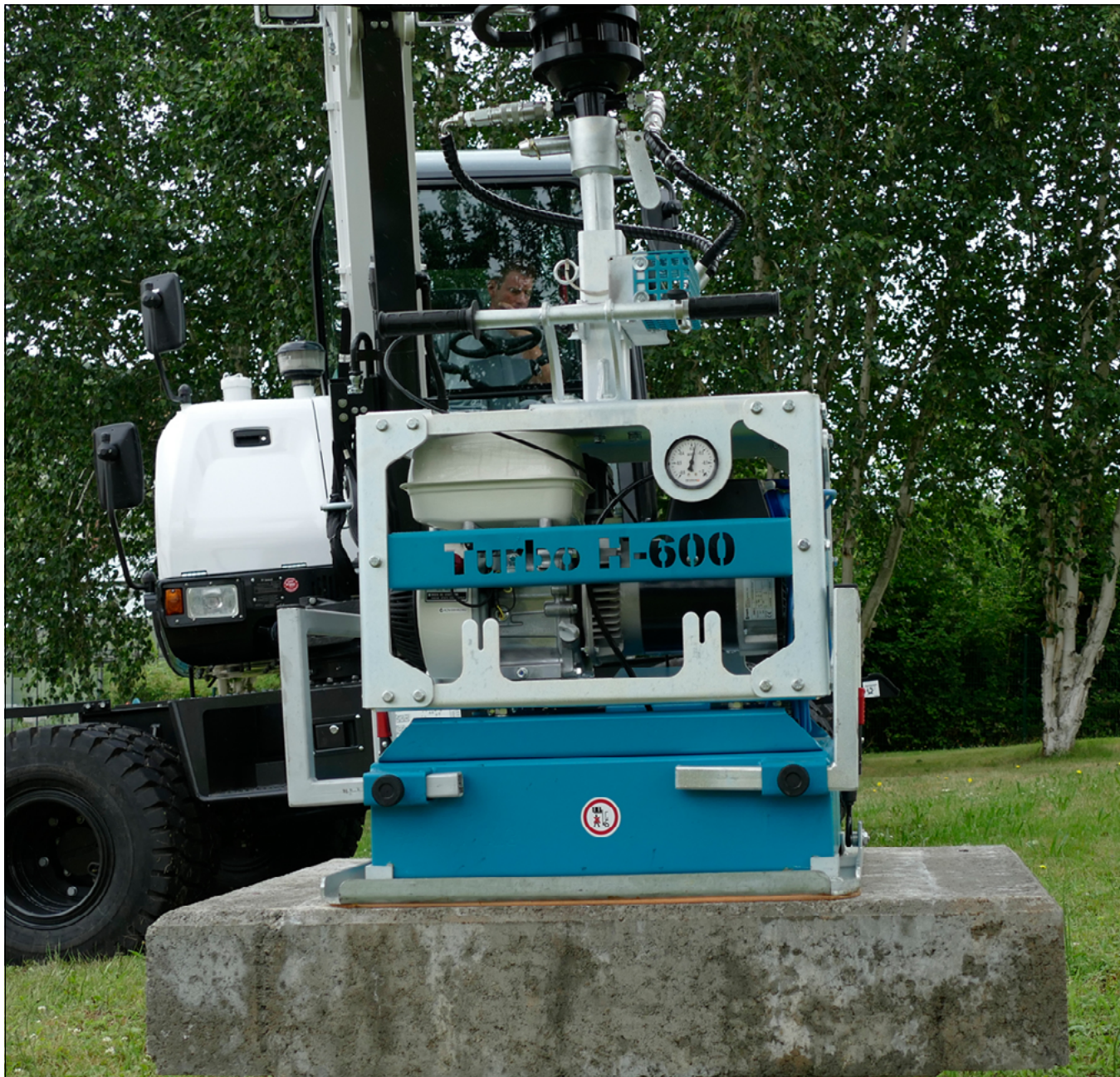
Turbo H-600 + hydraulic module + generator + suction plate GG 175