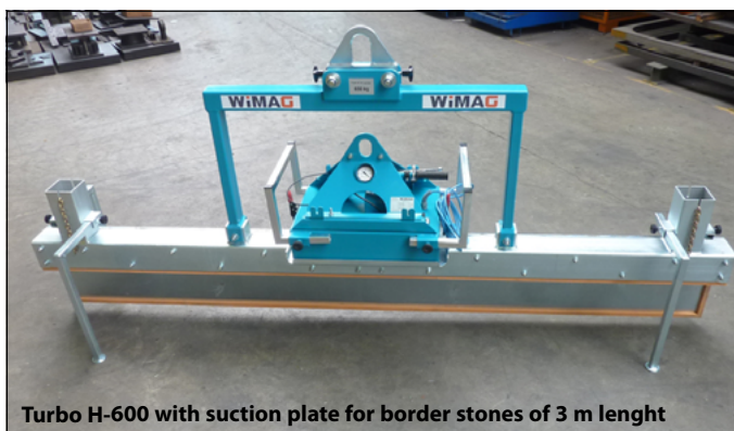
Turbo H-600 with suction plate for border stones of 3 m length